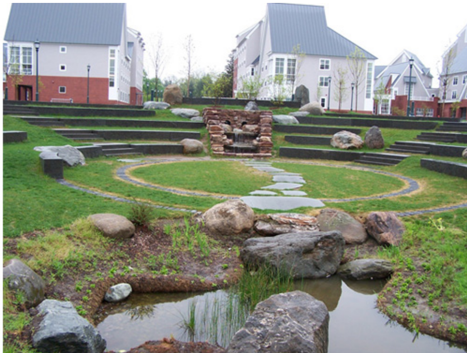
Figure 5. Multifunctional stormwater treatment feature in the residential dormitory green space at the University of Vermont.