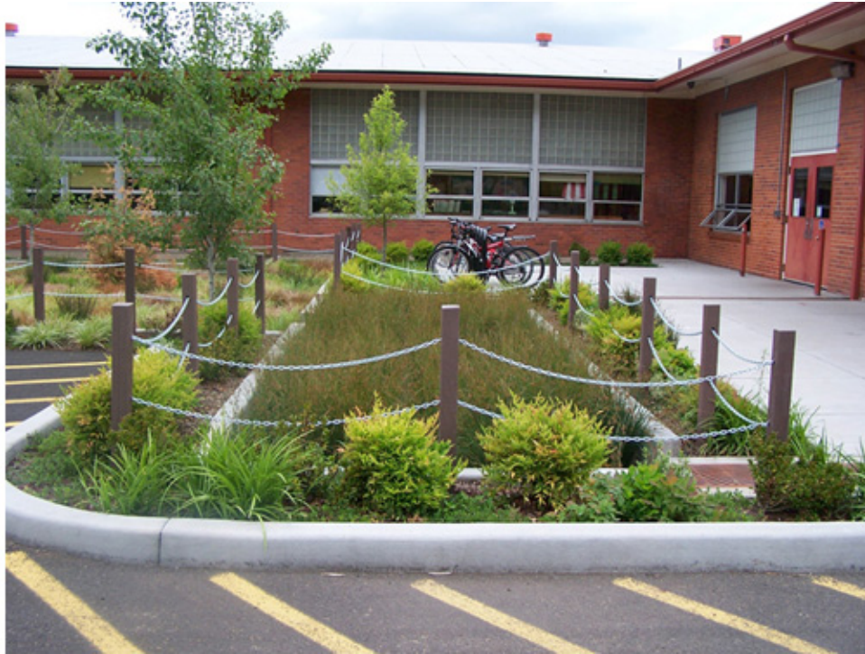
Figure 3. A raingarden that is designed to treat and infiltrate stormwater from the rooftop and parking lot of Mount Tabor Middle School in Portland, Oregon, also serves an educational function.

performance. Below, we explore several applications of these and other features that could greatly impact the health of landscapes and the communities that depend on them within urban and agricultural environments.