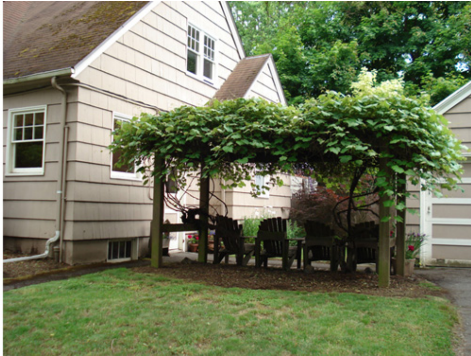
Figure 4. A grapevine arbor in a residential yard provides shade as well as an edible product for the homeowners.

approach, using agricultural corridors to connect other vegetative patches in urban environments (Viljoen 2005).