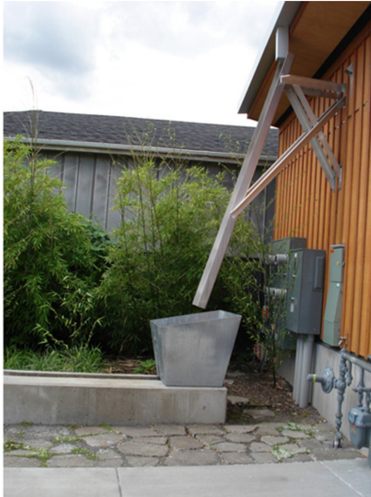
Figure 7. Rainwater from a rooftop is diverted to nearby gardens to support vegetation. This feature also serves an aesthetic function as rainwater creates a waterfall.

the analysis to characterize the status and change of important ecosystems (Laacke 1995). Geographic information systems (GIS) have greatly enhanced the ability to analyze landscapes in both spatial and temporal dimensions (Aschenwald et al. 2001, Smith et al. 2003).