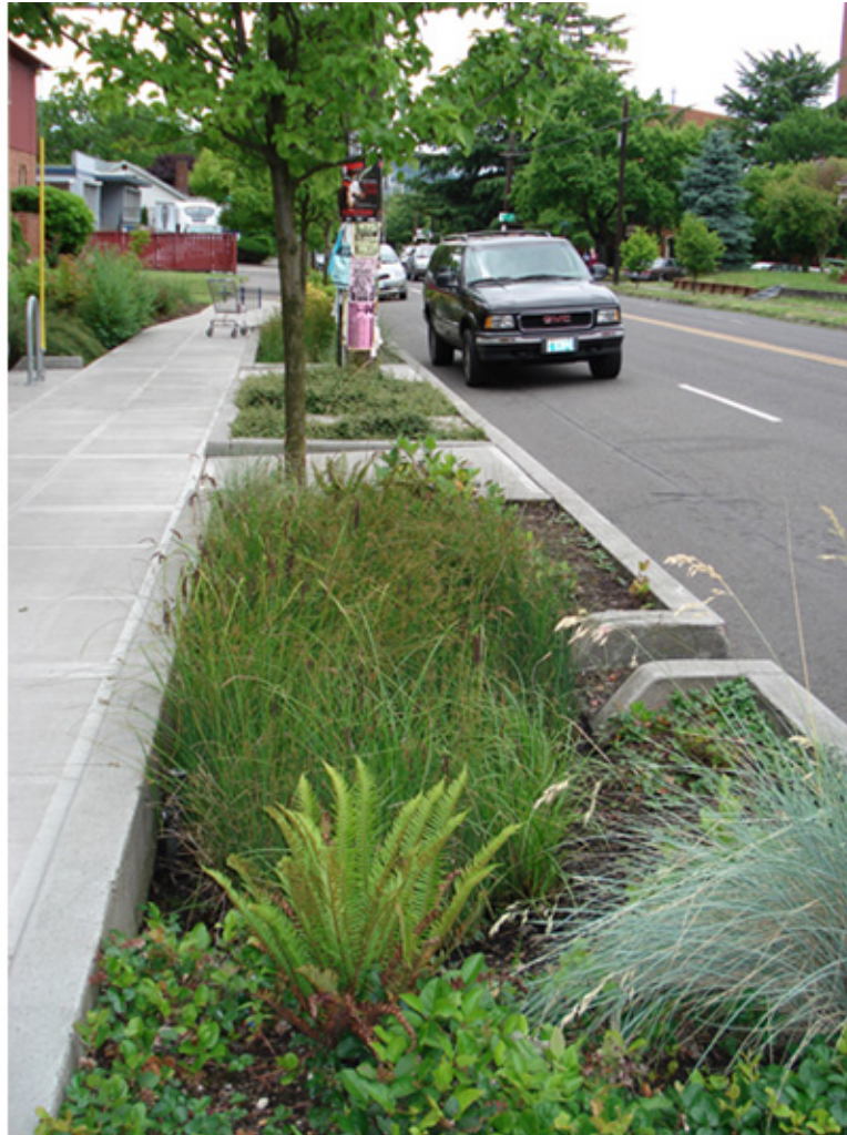
Figure 6. Raingardens developed between streets and sidewalks infiltrate stormwater from these impervious surfaces, while also supporting diversity in vegetation.

change (Seto and Fragkias 2005), population density (Kasanko et al. 2006), biodiversity restoration (Nordlind and Ostlund 2003), and many other variables. Comparative analysis can also be effective in assessing the impact of policy and planning decisions on the implementation of alternative spatial structures. Erickson (2004), for example, compared the historical context, institutional structures, and spatial patterns of two cities to develop a better understanding of the factors underlying the implementation of greenway systems. A number of organizing strategies have been used to improve comparative analysis