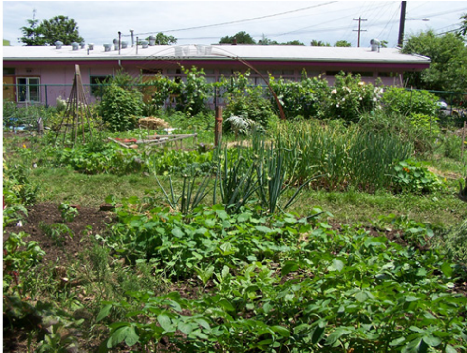
Figure 2. Community garden for the production of food and flowers.

of different types of designs exist for large-scale stormwater treatment in detention or retention basins, small-scale stormwater infiltration systems (Fig. 3) typically take the form of “bioswales” (shallow ditches often used along edges of parking lots), rain gardens (planted depressions accepting runoff from a building), or green roofs (rooftops covered with vegetation and a supportive substrate) (City of Portland 2004, Oberndorfer et al. 2007). Although these features are primarily designed to support regulating services (i.e., water control), the potential also exists to support production functions through the growth of woody biomass for energy, or cultural functions through the provision of visual quality and recreation.